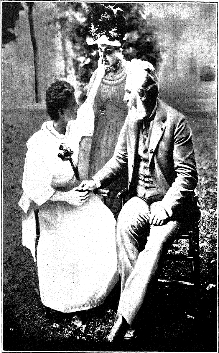
Miss Keller, Miss Sullivan and Dr. Bell, Nova Scotia, 1901.